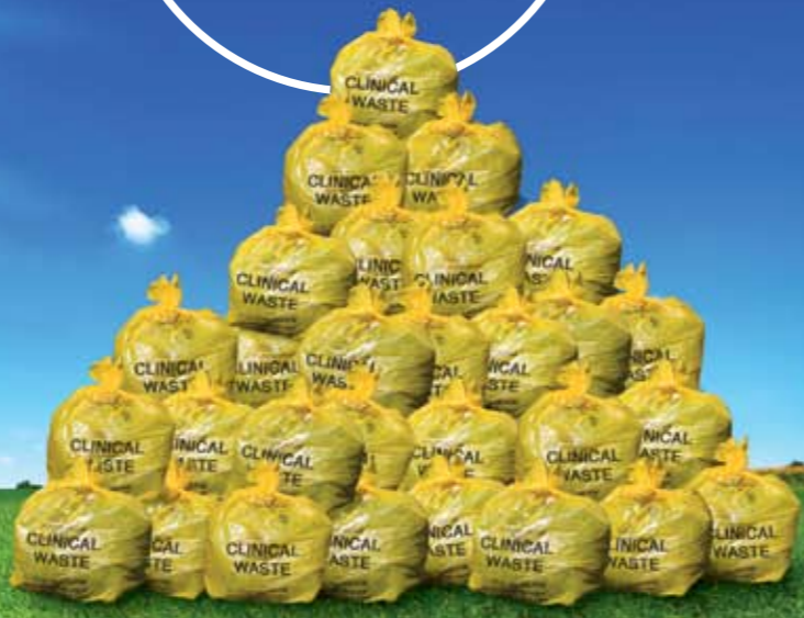
Waste from 100 Lap Chole's using fully disposable instruments